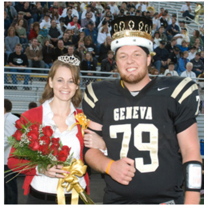
He looks like he REALLY wants to be there...