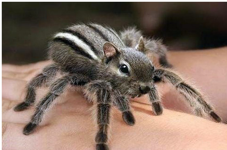
God forbid that chipmunk be a chipmunk-tula.

Advertising inquiries, questions & comments should be directed to bull@mtu.edu